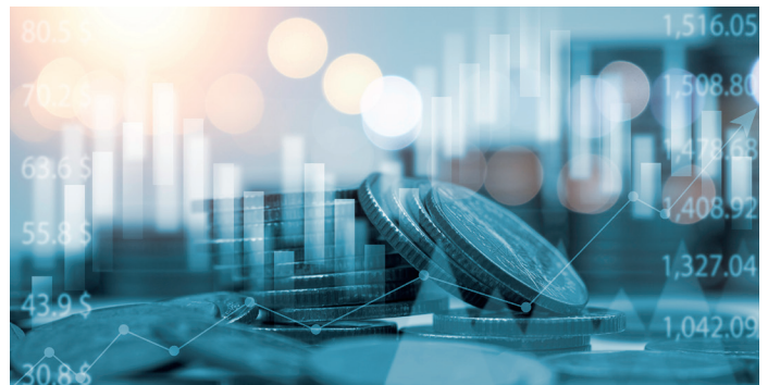
Impact of Dividends in Contributing to Total Returns: Growth of $10,000 Invested in S&P/TSX Composite Index, 1977–2020

When we look to equities to support the generation of a reliable stream of income, the use of quality, dividend-paying equities has been a good strategy. In many cases, well-established, stable dividend-paying businesses have continued to grow their dividends. With many corporations posting strong earnings, various Canadian companies announced increasing dividend payouts in the latter part of 2021. Some analysts expect this to continue as dividend growth has lagged the earnings surge. 1 Historically, dividends have consistently and significantly contributed to total returns (chart above), helping to offset declines during market volatility. As an added benefit, for Canadian investors, dividends and capital gains are taxed at a lower rate than ordinary and interest income.