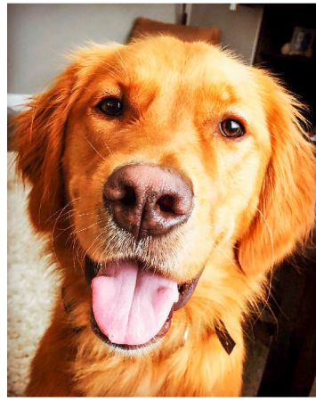
Bauer is pooped after swimming all day.